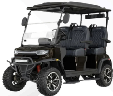
Black Metallic Pearl