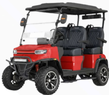
Torch Red Metallic